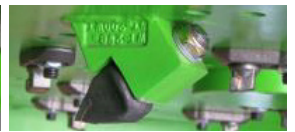
Shark Extension Tooth