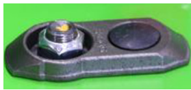
Tooth Holder Delete Kit