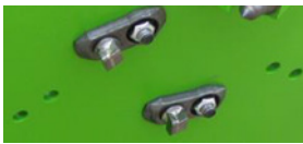
Carbide Thumbnail Teeth