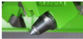
Carbide Bullet Extension Tooth